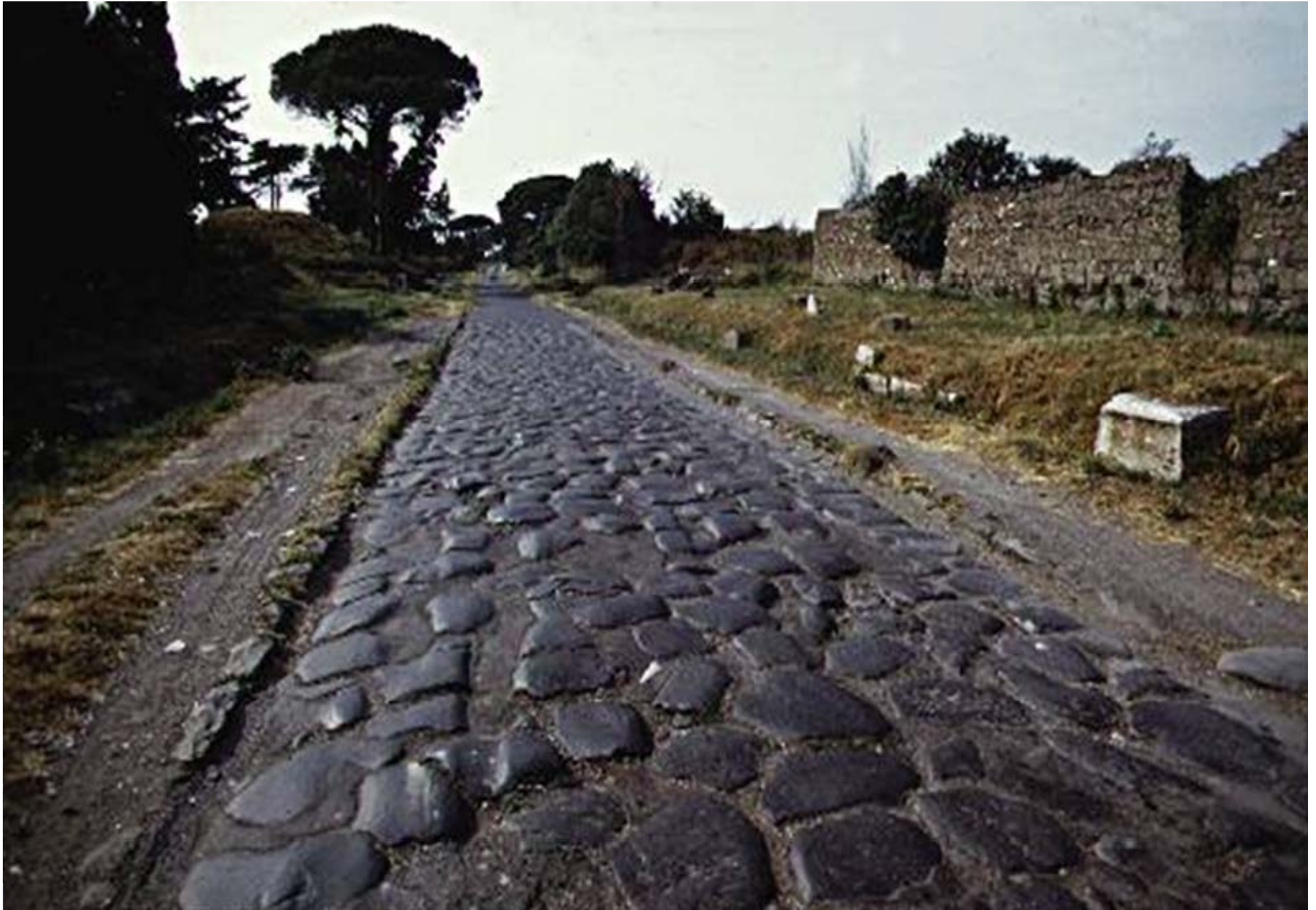
STONE PAVED ROAD