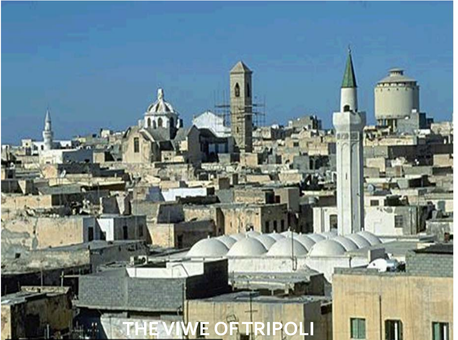
THE VIWE OF TRIPOLI