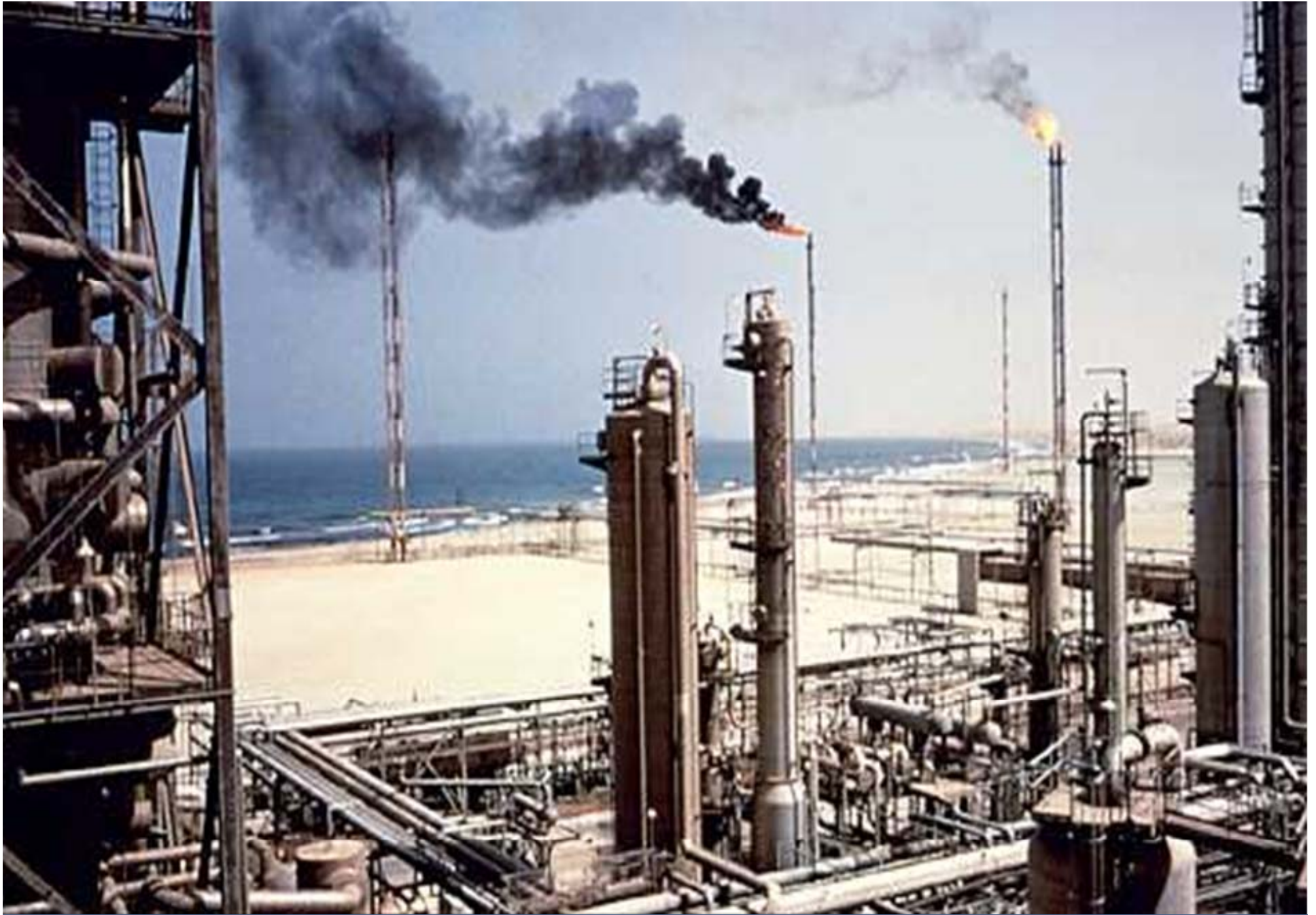
PETROLIUM REFINERY IN TRIPOLI.