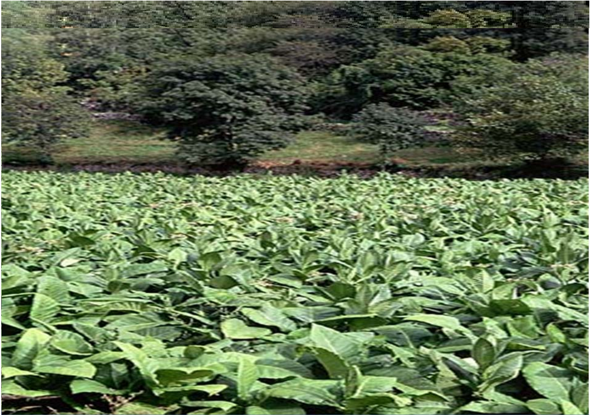
TOBACCO PLANTATION IN LIBYA