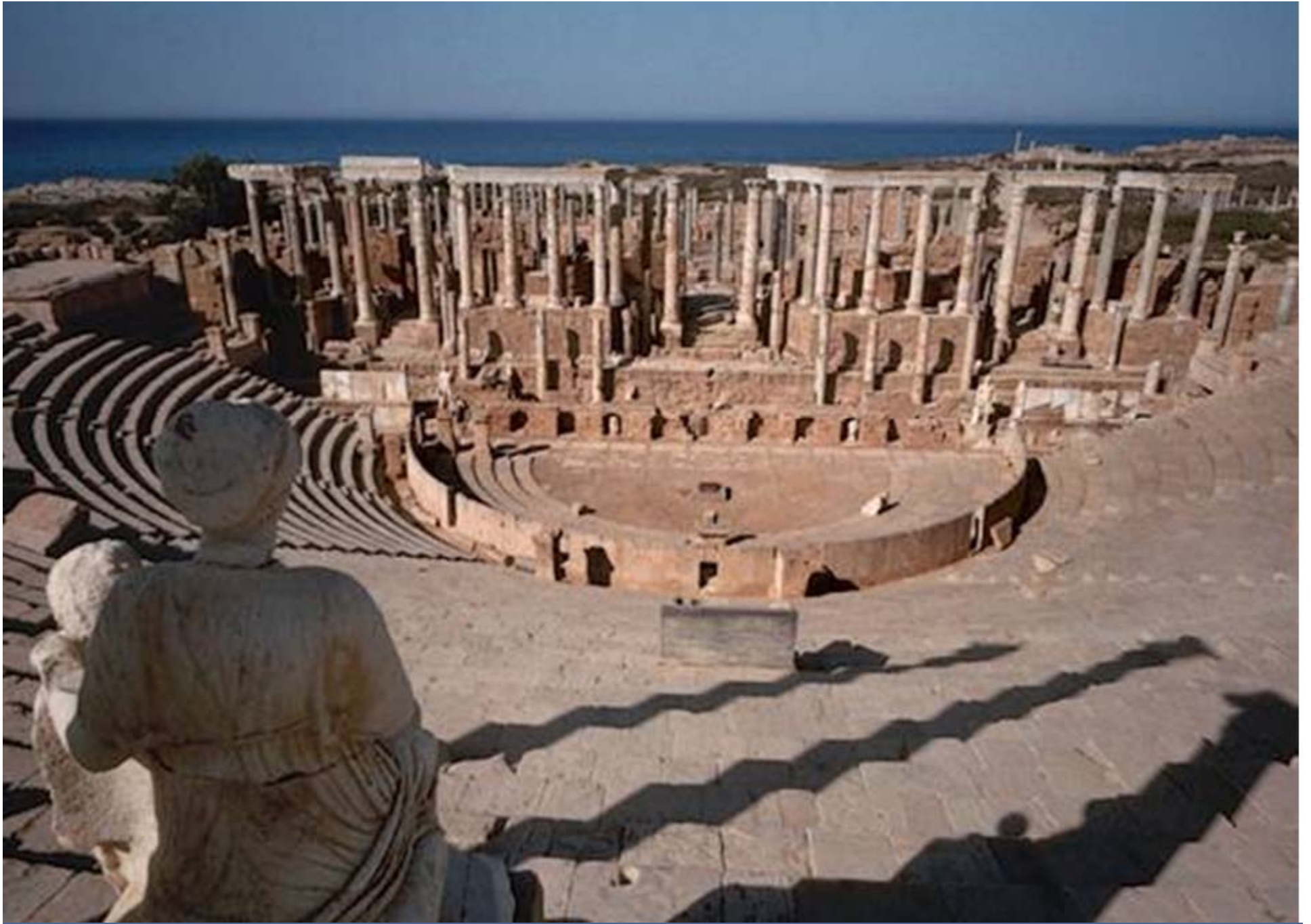
THEATER AT LEPCIS MAGNA