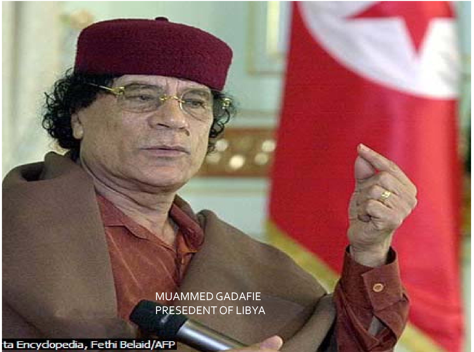
MUAMMED GADAFIE PRESEDENT OF LIBYA