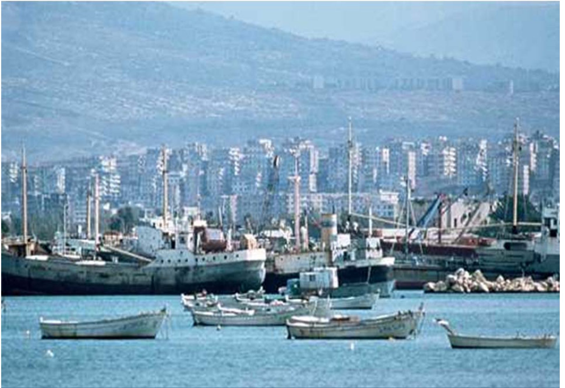
PORT OF TRIPOLI